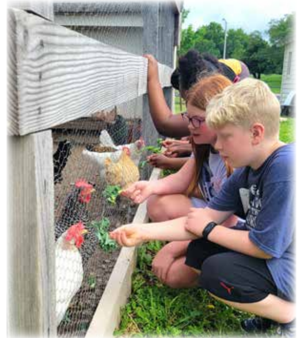
Cover Picture: Come feed the chickens at Shawnee Town 1929!

This document, meeting agendas and packets, and other information about Shawnee, are available at cityofshawnee.org .