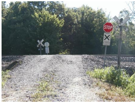
3 5901 Woodland Drive – Passive warning device only. Signed as private but records show this as a public crossing