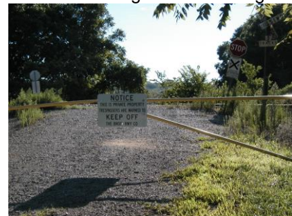
6 75 th Street – Passive warning device only