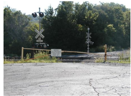
4 71 st Street – Flashing lights only, no constant warning time monitoring