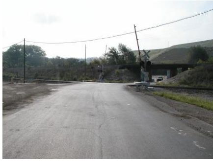
1 Wilder Drive – Flashing lights with gates and constant warning time monitoring