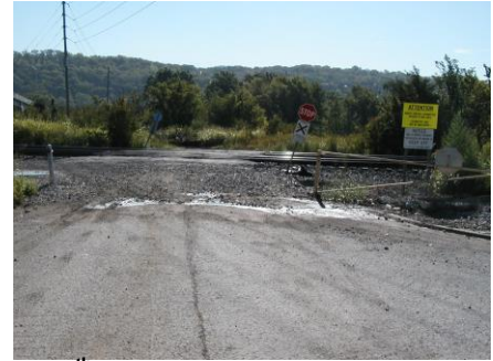
2 55 th Street – Passive warning device only