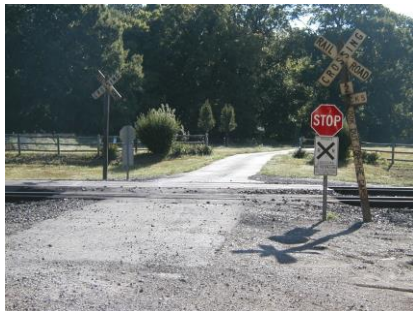
5 7315 Martindale – Passive warning device only