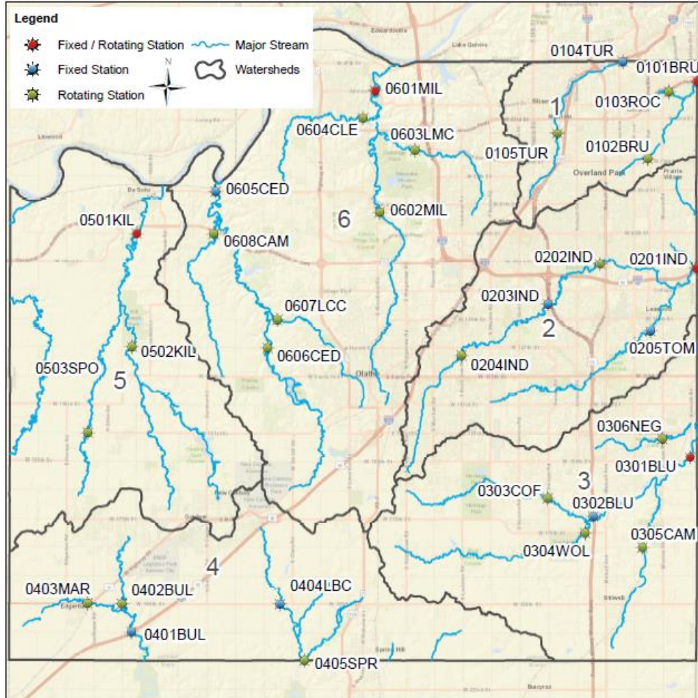
Figure 1. Locations of Fixed and Rotating Monitoring Stations